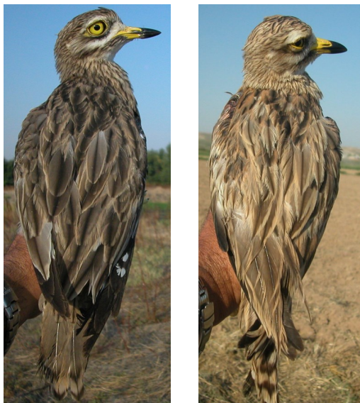
Stone-curlew. Upperpart pattern: left 1st year autumn (09-IX); right juvenile (27-VII).