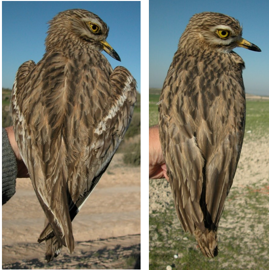
Stone-curlew. Upperpart pattern: left adult (08-IV); right 2nd year spring (11-IV).