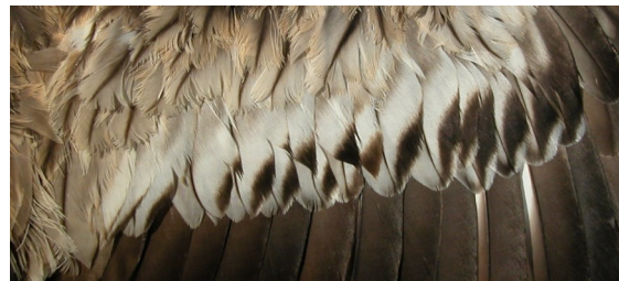
Stone-curlew. Adult: pattern of greater coverts (08-IV).