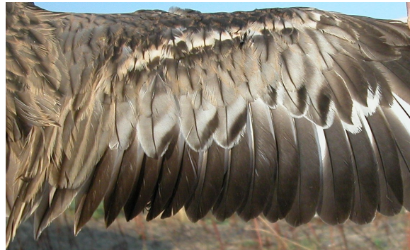
Stone-curlew. 1st year autumn: pattern of secondaries (09-IX).