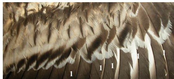
Stone-curlew. 2nd year spring: pattern of greater coverts (1 juvenile feathers) (08-IV).