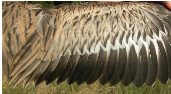
Stone-curlew. Juvenile: pattern of secondaries (27-VII).