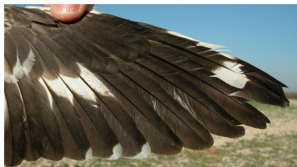
Stone-curlew. 2nd year spring: pattern of primaries (11-IV).