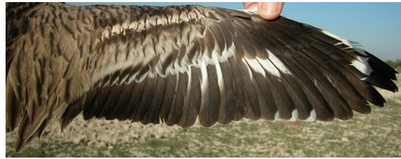
Stone-curlew. 2nd year spring: pattern of wing (11-IV).