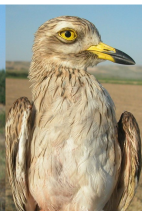
Stone-curlew. Breast pattern: left 1st year autumn (09-IX); right juvenile (27-VII).