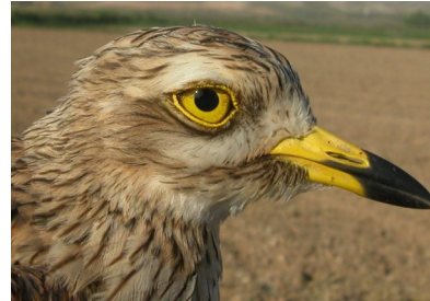
Stone-curlew. Head pattern: top 1st year autumn (09-IX); bottom juvenile (27-VII).