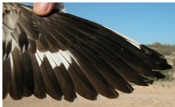
Stone-curlew. Adult: pattern of primaries (08-IV).