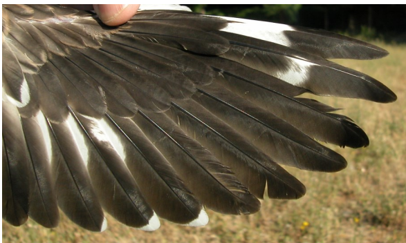
Stone-curlew. Juvenile: pattern of primaries (27-VII).