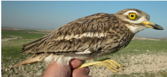
Stone-curlew. 2nd year spring (11-IV).