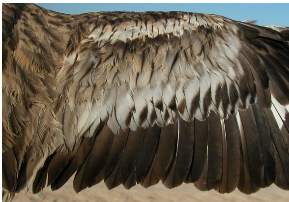
Stone-curlew. Adult: pattern of secondaries (08-IV).