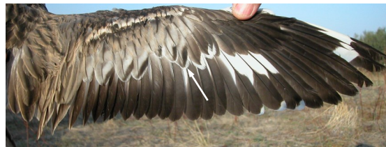
Stone-curlew. 1st year autumn: pattern of wing (09-IX)