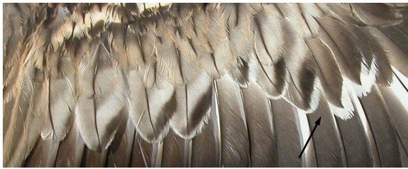
Stone-curlew. 1st year autumn: pattern of greater coverts (09-IX).