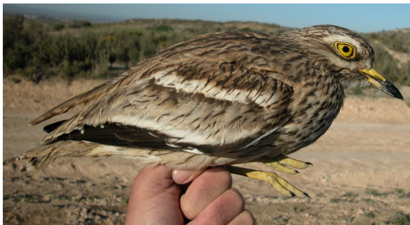
Stone-curlew. Adult (08-IV).