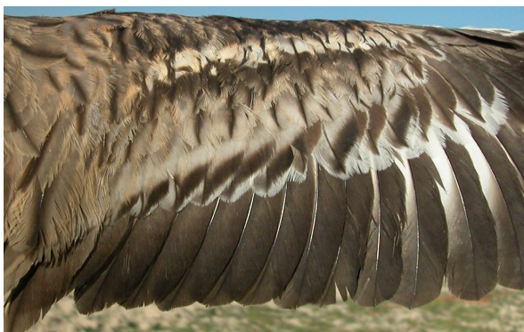
Stone-curlew. 2nd year spring: pattern of secondaries (11-IV).