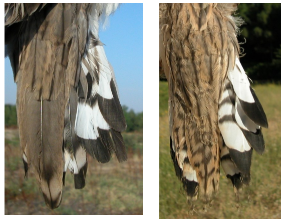
Stone-curlew. Tail pattern: left 1st year autumn (09-IX); right juvenile (27-VII).