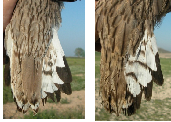
Stone-curlew. Tail pattern: left adult (08-IV); right 2nd year spring (11-IV).