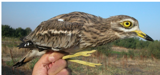
Stone-curlew. 1st year autumn (09-IX).