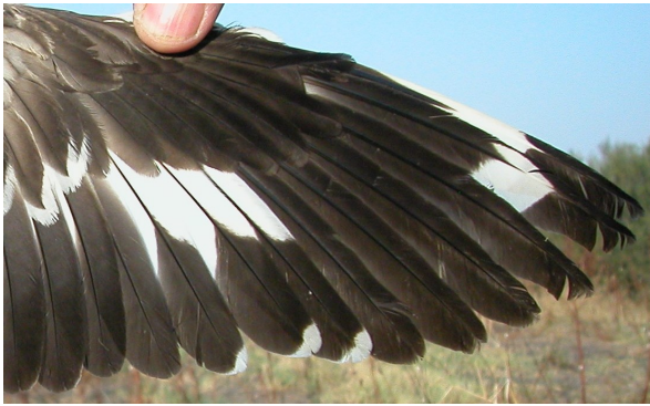
Stone-curlew. 1st year autumn: pattern of primaries (09-IX).