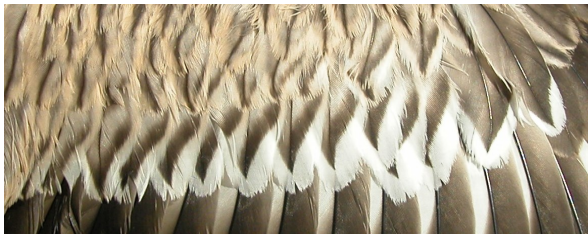
Stone-curlew. Juvenile: pattern of greater coverts (27-VII).