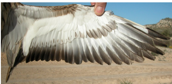
Stone-curlew. Adult: pattern of wing (08-IV).