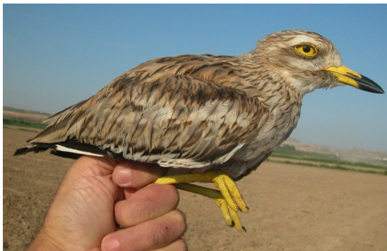
Stone-curlew. Juvenile (27-VII).