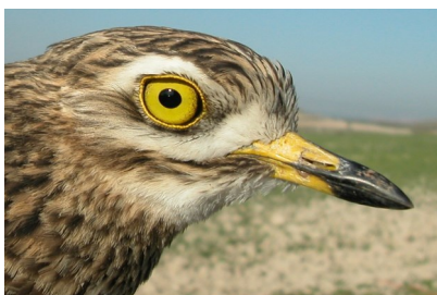
Stone-curlew. Head pattern: top adult (08-IV); bottom 2nd year spring (11-IV).