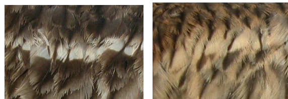
Stone-curlew. Ageing. Pattern of longer lesser coverts: left adult; right juvenile.

Adult usually with several ages and wear on flight feathers; longer lesser coverts white barred dark at tip; all greater coverts with a thin white edge on outer web and a dark band.