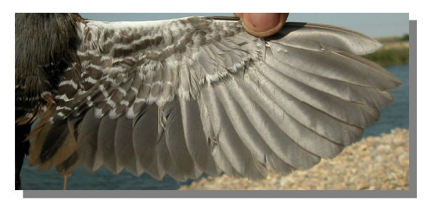
Water Rail. Autumn. 1st year: pattern of wing (27-VIII)