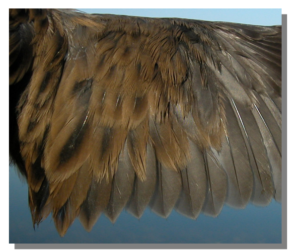
Water Rail. Spring. Juvenile: pattern of secondaries (14-VII).