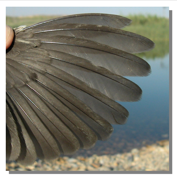
Water Rail. Spring. Juvenile: pattern of primaries (14-VII).