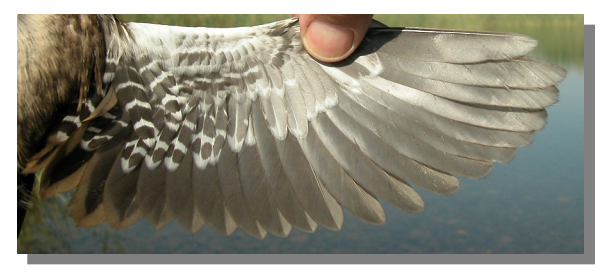
Water Rail. Spring. Juvenile: pattern of wing (14-VII).