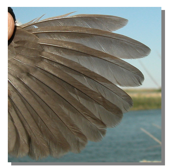
Water Rail. Autumn. 1st year: pattern of primaries (27-VIII)