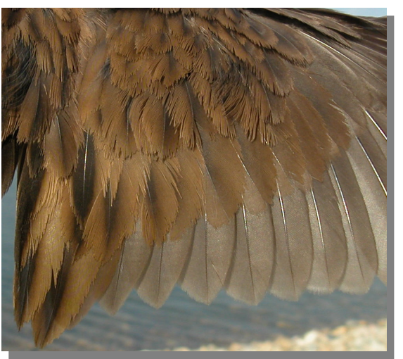
Water Rail. Spring. Adult: pattern of secondaries (06-VI).