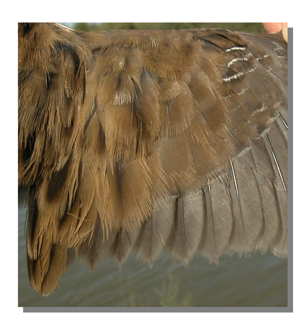
Water Rail. Autumn. Adult: pattern of secondaries (02-IX)