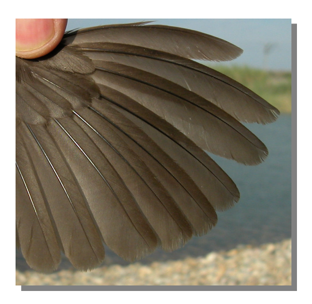
Water Rail. Spring. Adult: pattern of primaries (06-VI).