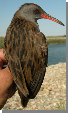
Water Rail. Autumn. Upperpart pattern: left adult (02 -IX); right 1st year (27-VIII).