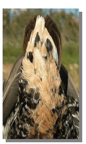
Water Rail. Spring. Pattern of undertail coverts: top left adult (06-VI); top right 2nd year (14-V); left juvenile (14-VII).