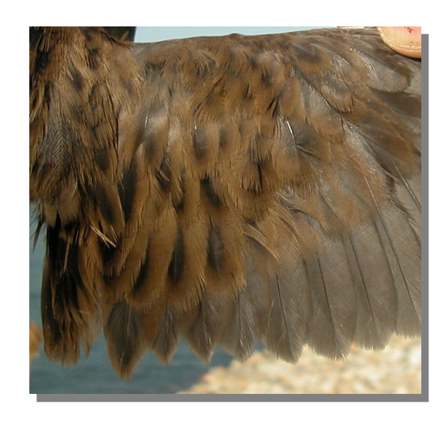
Water Rail. Autumn. 1st year: pattern of secondaries (27-VIII)