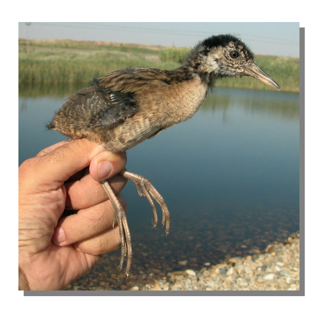
Water Rail. Spring. Young (14-VII)

Resident, distributed in Gallocanta, Canal de Berdun and rivers Ebro, Jalon and Piedra.