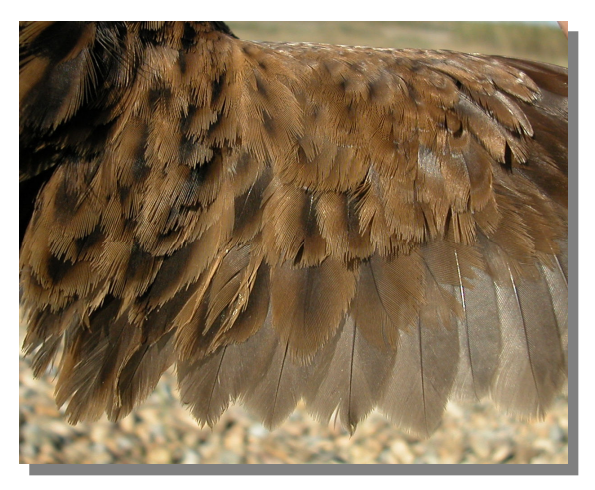
Water Rail. Spring. 2nd year: pattern of secondaries (14-V).