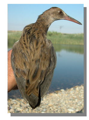
Water Rail. Spring. Upperpart pattern: top left adult (06-VI); top right 2nd year (14-V); left juvenile (14-VII).