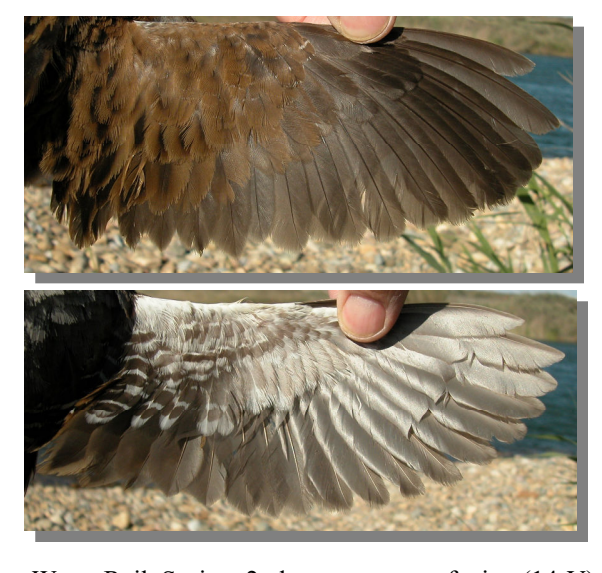
Water Rail. Spring. 2nd year: pattern of wing (14-V).