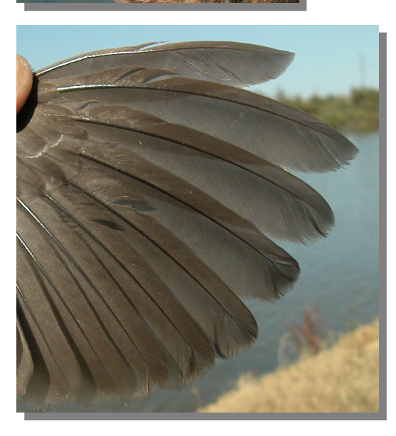
Water Rail. Autumn. Adult: pattern of primaries (02-IX)