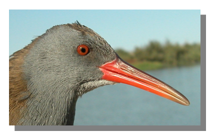
Water Rail. Autumn. Head pattern: top adult (02-IX); bottom 1st year (27 -VIII).