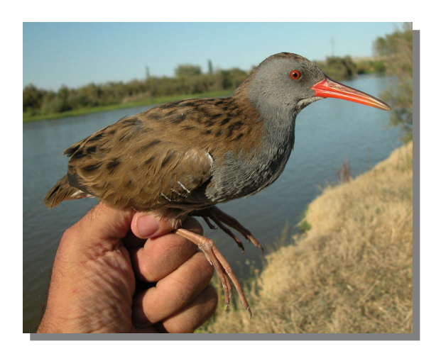
Water Rail. Autumn. Adult (02-IX).