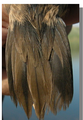
Water Rail. Spring. Tail pattern: top left adult (06-VI); top right 2nd year (14-V); left juvenile (14-VII).