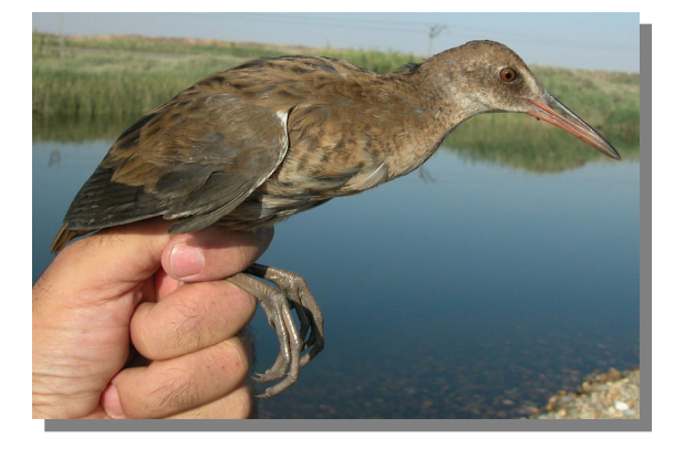
Water Rail. Spring. Juvenile (14-VII)