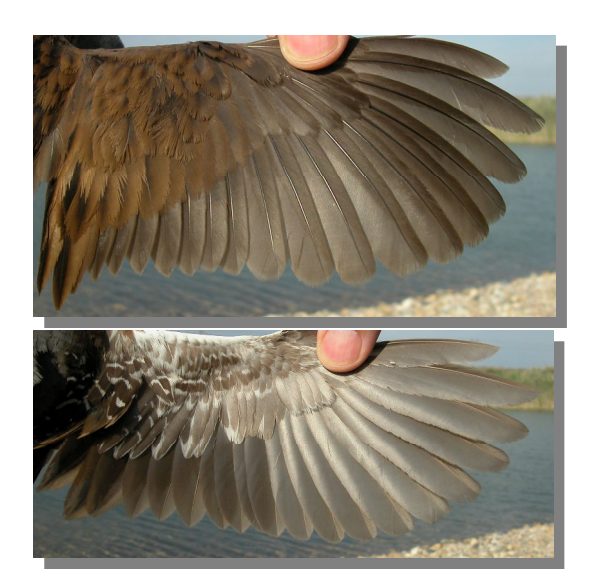
Water Rail. Spring. Adult: pattern of wing (06-VI).