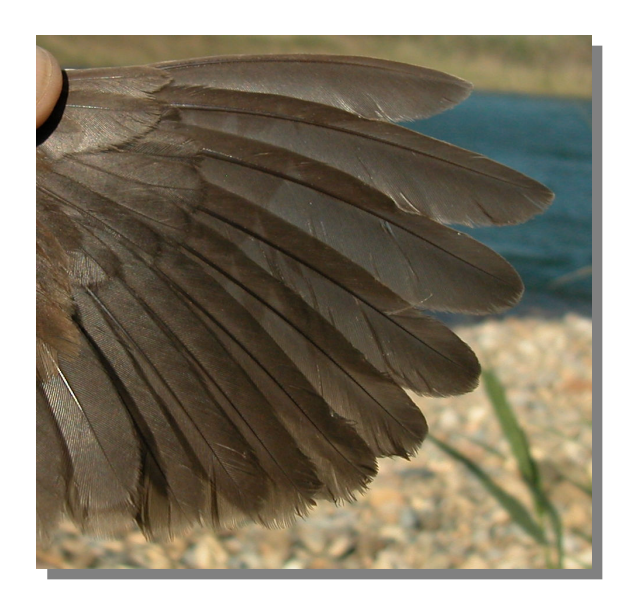
Water Rail. Spring. 2nd year: pattern of primaries (14-V).