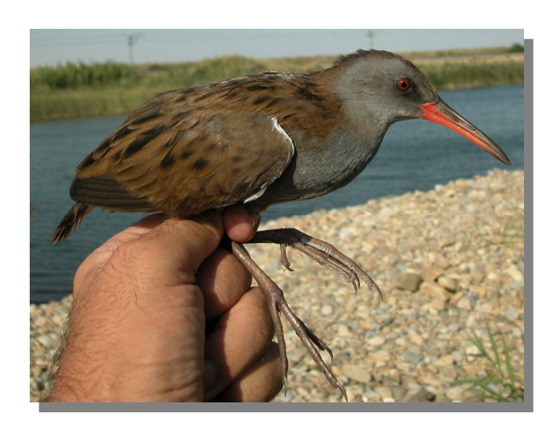
Water Rail. Autumn. 1st year (27-VIII).