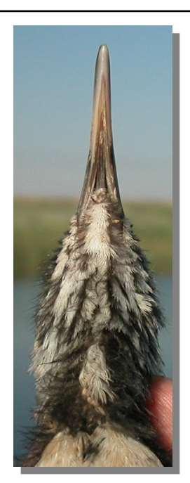
Water Rail. Spring. Chin pattern: left juvenile (14-VII); right young (14-VII).