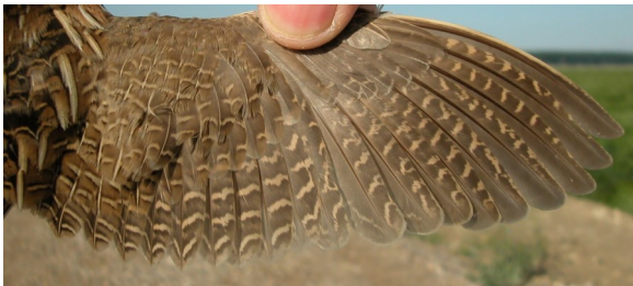
Quail. Adult: pattern of wing (04-V).