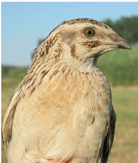
Quail. Ageing. Pattern of breast: top adult female; bottom juvenile male.