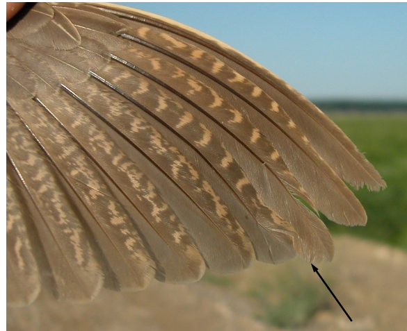
Quail. 2nd year: pattern of primaries in early hatching birds (26-IV).