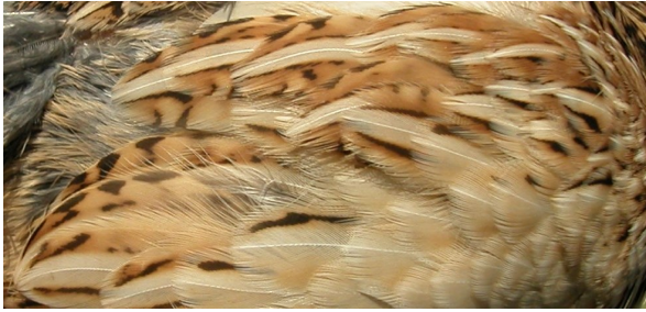
Quail. 2nd year. Female: flank pattern (08-IV).