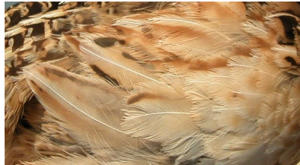
Quail. Adult. Female: flank pattern (29-VII).