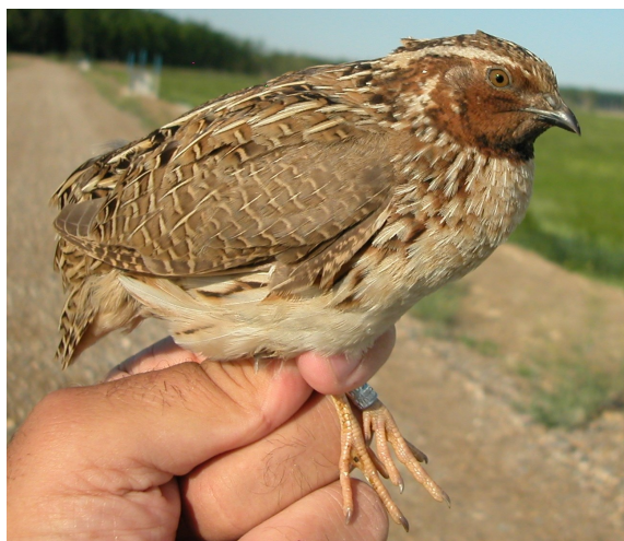
Quail. Adult. Male dark morph (04-V).