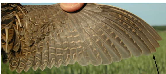
Quail. 2nd year: pattern of wing in late hatching birds (04-V).