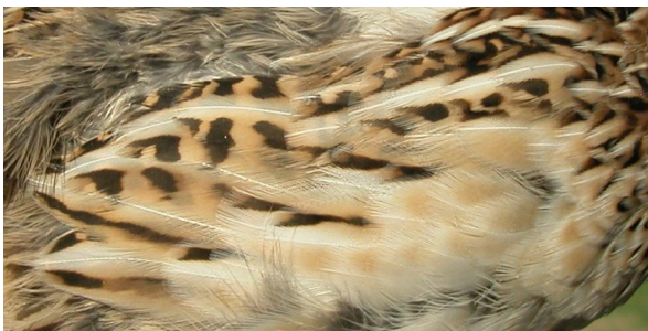
Codorniz común. Juvenil. Hembra. Diseño de las plumas del flanco (27-IV).