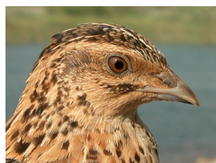
Quail. Female. Pattern of breast, head and upperparts.