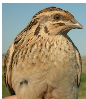
Quail. 2nd year. Breast pattern: left male (04-V); right female (08-IV).