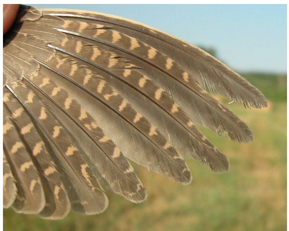
Quail. Juvenile: pattern of primaries in early hatching birds (09-VII).