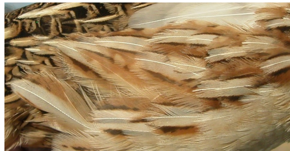
Quail. Adult. Male: flank pattern (04-V).