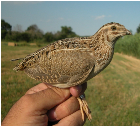
Quail. Juvenile. Male (09-VII).