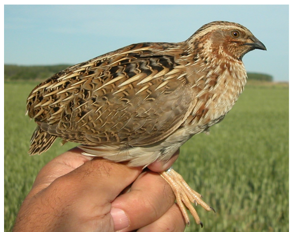
Quail. 2nd year. Male (04-V)