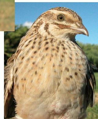
Quail. Juvenile. Sexing. Pattern of throat and breast: left male; right female.