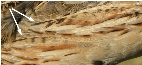
Quail. Juvenile. Male: flank pattern (09-VII).