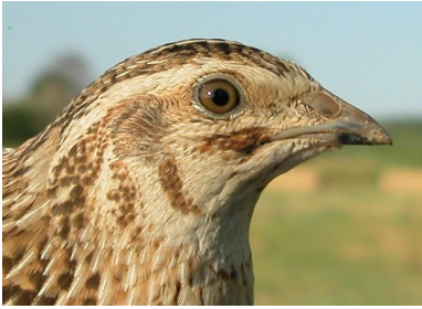
Quail. Juvenile. Head pattern and iris colour: top male (09-VII); bottom female (20-VIII)