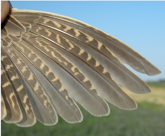
Quail. Juvenile: pattern of primaries in late hatching birds (09-VII).