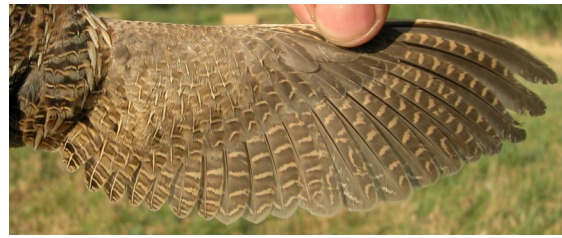
Quail. Juvenile: pattern of wing in early hatching birds (09-VII).