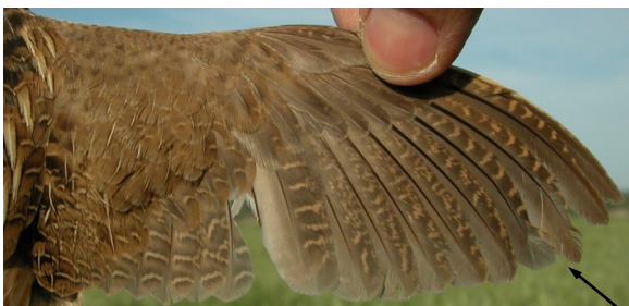
Quail. 2nd year: pattern of wing in early hatching birds (26-IV).