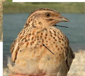
Quail. Adult. Sexing. Pattern of throat and breast: left male; right female.