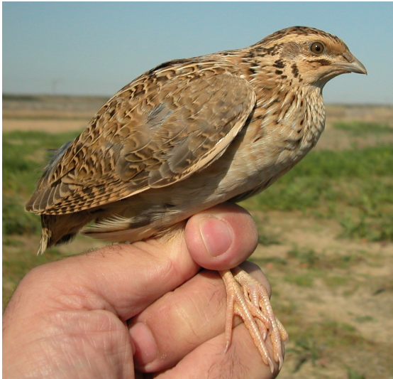
Quail. 2nd year. Female (08-IV)