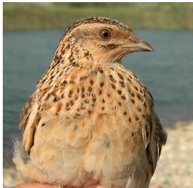
Quail. Adult. Breast pattern: top left male dark morph (04-V); top right male pale morph (04-V); left female (29-VII)