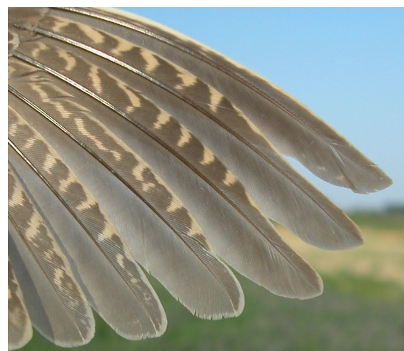
Quail. Ageing. Mould in primaries: top adult; middle 2nd year; bottom juvenile.