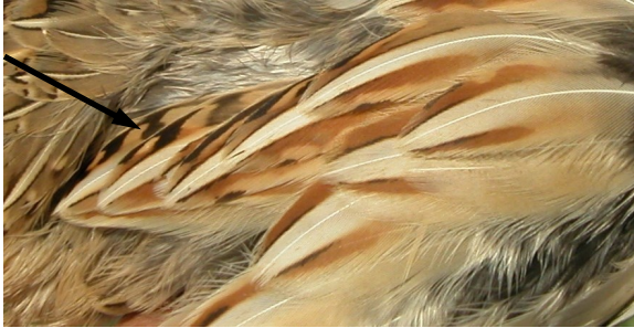
Quail. Male. Ageing. Pattern of flank: top adult; bottom 2nd year.