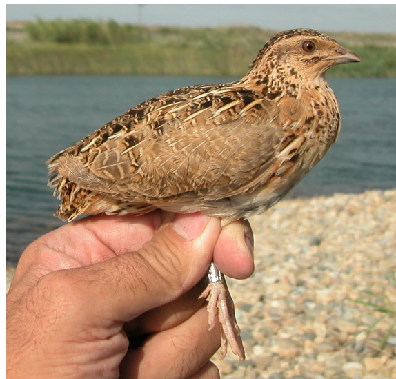
Quail. Adult. Female (29-VII)