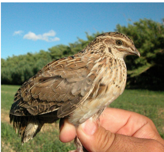
Quail. Juvenile. Female (20-VIII).