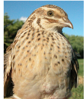
Quail. Juvenile. Breast pattern: left male (09-VII); right female (20-VIII)