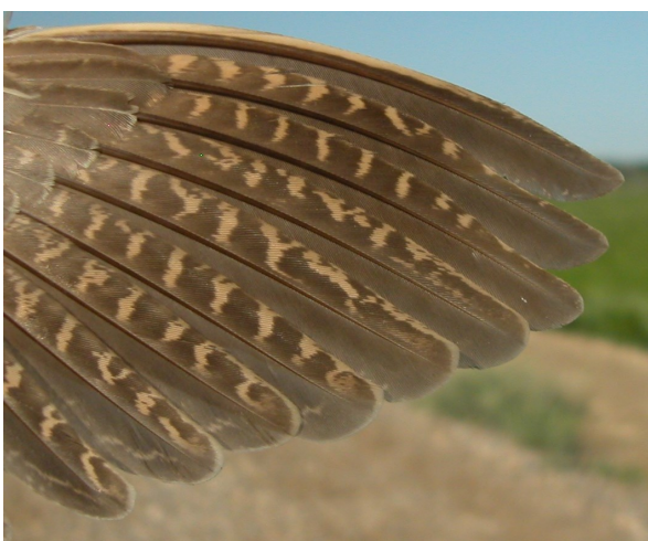
Quail. Adult: pattern of primaries (04-V).