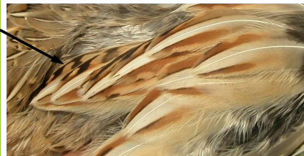
Quail. 2nd year. Male: flank pattern (04-V).