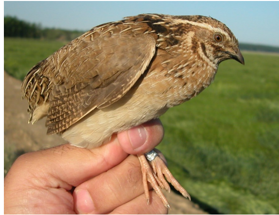
Quail. Adult. Male pale morph (04-V)