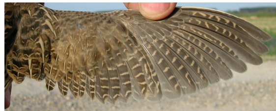
Quail. Juvenile: pattern of wing in late hatching birds (09-VII).