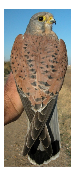
Common Kestrel. Adult. Male. Pattern of upperparts: spotted feathers.

Lesser Kestrel. Adult. Male. Pattern of upperparts: unspotted feathers.