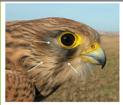
Common Kestrel. Adult. Female.

Lesser Kestrel. Pattern of head: dark moustachial stripe poorly distinc, pale cheeks with thin streaks and no dark line on the eye.