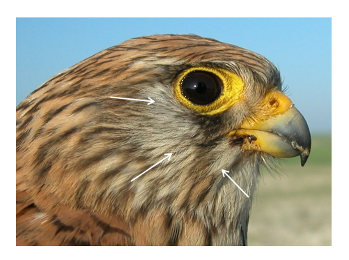
Lesser Kestrel. Adult. Fe-male.

Adult female and juvenile can be separated by pattern of head and pattern of median wing coverts. CAUTION : some of these characters are no always possible to see due to overlap.