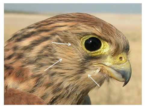
Lesser Kestrel. Juvenile.

Lesser Kestrel. Pattern of head: dark moustachial stripe poorly distinc, pale cheeks with thin streaks and no dark line on the eye.