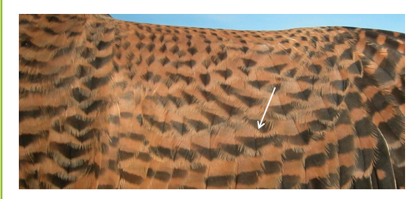
Common Kestrel. Adult. Female. Pattern of median wing coverts: dark band on edge with triangular shape.

http://blascozumeta.com http://www.aranzadi.eus <sup>2</sup>