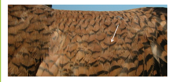
Lesser Kestrel. Adult. Female. Pattern of median wing coverts: dark band on edge with V-shape.

Common Kestrel. Pattern of head: dark moustachial stripe clearly distinc, pale cheeks with dark streaks and thin dark line on the eye.