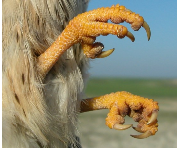
Lesser Kestrel. Colour of claws: colour pale.

All ages and sexes can be separated by colour of claws and wing formula.