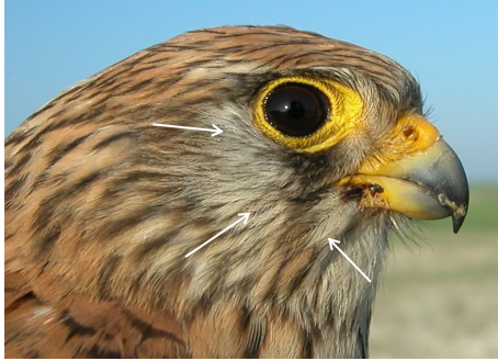
Lesser Kestrel. Adult. Female.

CAUTION: some of these characters are no always possible to see due to overlap.