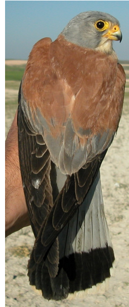
Lesser Kestrel. Adult. Male. Pattern of upperparts: unspotted feathers.

Adult male can be separated by pattern of upperparts.