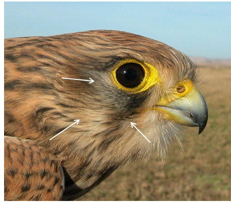
Common Kestrel. Adult. Female.

Lesser Kestrel. Pattern of head: dark moustachial stripe poorly distinct, pale cheeks with thin streaks and no dark line on the eye.