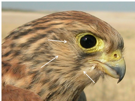
Lesser Kestrel. Juvenile.

Lesser Kestrel. Pattern of head: dark moustachial stripe poorly distinct, pale cheeks with thin streaks and no dark line on the eye.