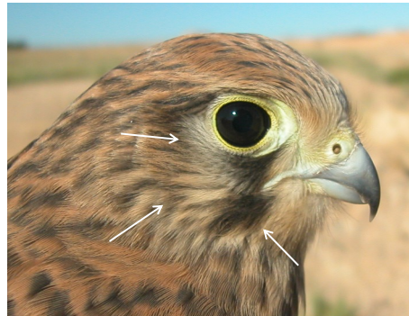
Common Kestrel. Juvenile.

Common Kestrel. Pattern of head: dark moustachial stripe clearly distinct, pale cheeks with dark streaks and thin dark line on the eye.