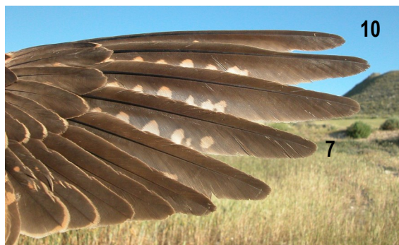
Lesser Kestrel. Wing formula: outermost primary longer than 7th.