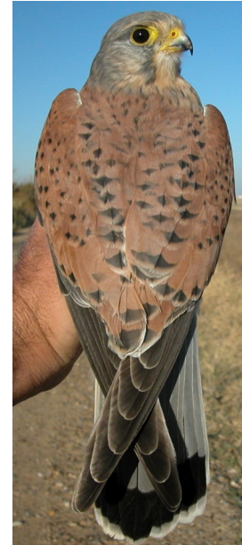
Common Kestrel. Adult. Male. Pattern of upperparts: spotted feathers.