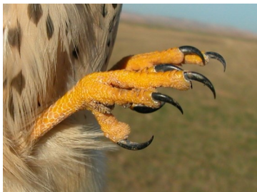
Common Kestrel. Colour of claws: colour black.