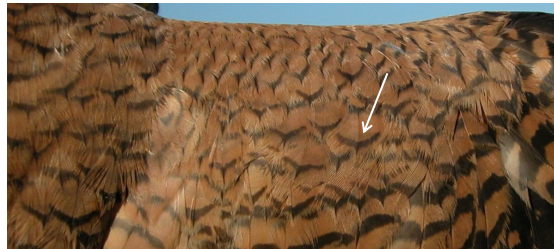
Lesser Kestrel. Adult. Female. Pattern of median wing coverts: dark band on edge with V-shape.

Common Kestrel. Pattern of head: dark moustachial stripe clearly distinct, pale cheeks with dark streaks and thin dark line on the eye.